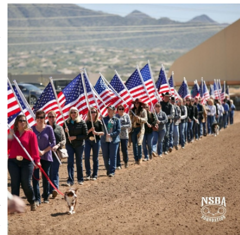
TROT's Program team in the Veteran Recognition Parade

Instruction revolved around the inclusion competition for Equestrians with Disabilities or Veterans using horses as a form of therapeutic riding but also included grant writing, fundraising, strategies for building industry networks and open discussion panels for each. Certified Professionals received continuing education credits for attending the Coaches Summit as outlined in their certification requirements.